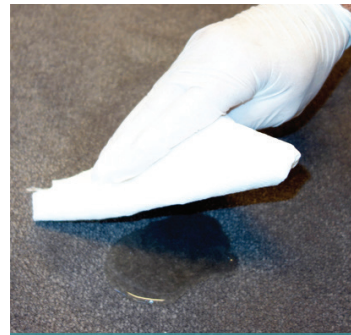
BLOT (IF WET)