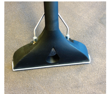
EXTRACT (IF NECESSARY)