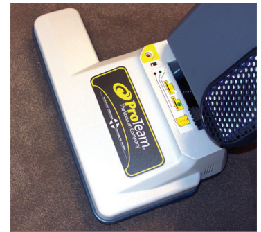
VACUUM (IF DRY)